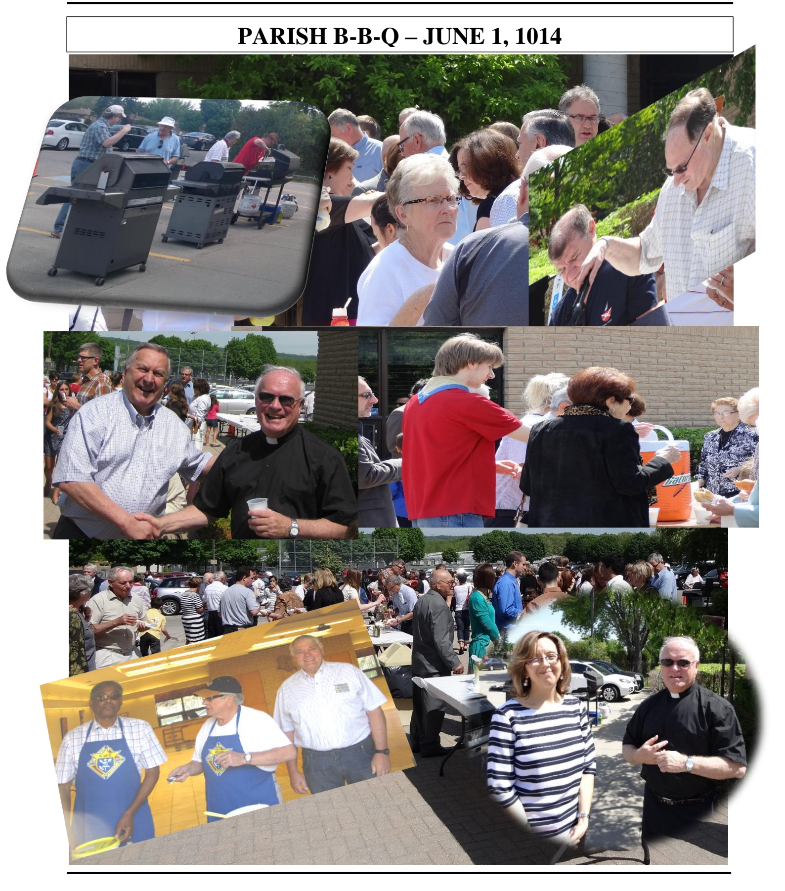
~ 4 ~ 287 Plains Road East, Burlington, Ontario L7T 2C7